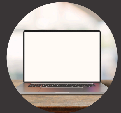
Via Web Browser