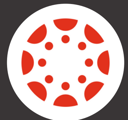
Canvas Student App (ios and Android)