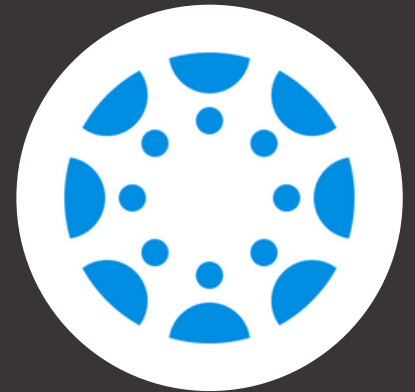
Canvas Parents App (ios and Android)

After creating an account you can access Canvas in a variety of ways.